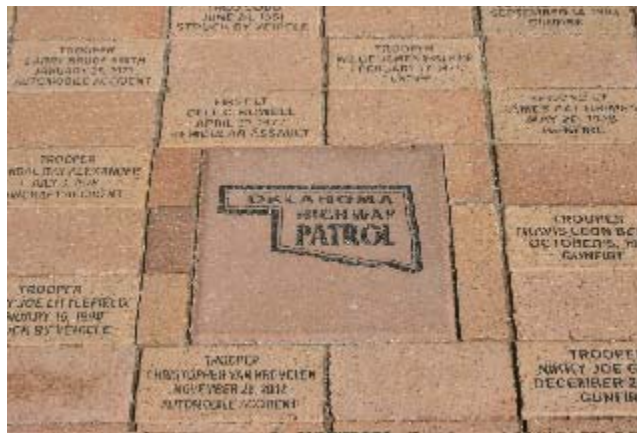
The OHP memorial at Falls Creek Baptist Assembly is in honor, and names, every trooper killed in the line of duty.

have given their lives in the name of public safety.”