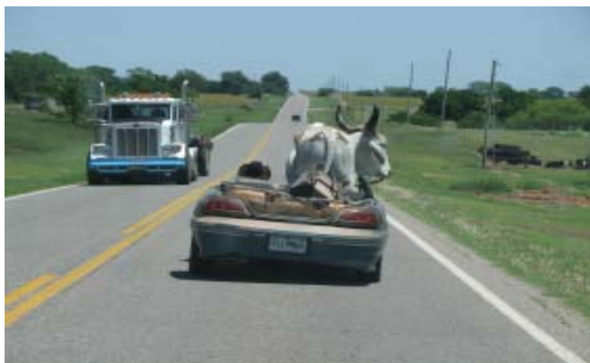
A driver transports a bull from Canton, Oklahoma, 23 miles to his sister’s house. His daughter had just ridden the bull in Canton’s history day parade.